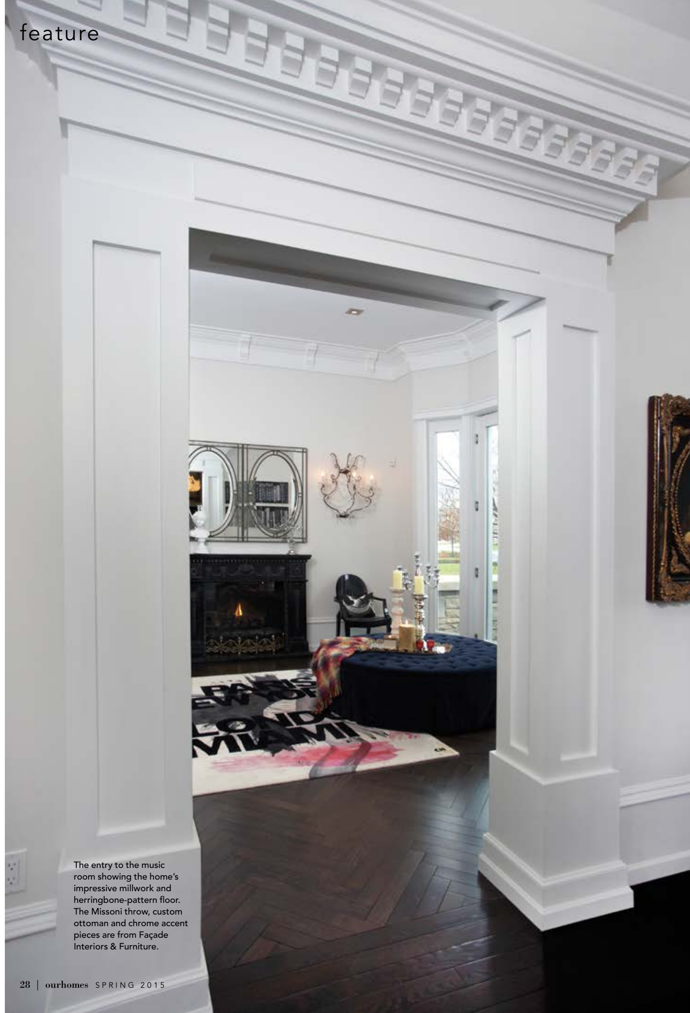
The entry to the music room showing the home's impressive millwork and herringbone-pattern floor. The Missoni throw, custom ottoman and chrome accent pieces are from Façade Interiors & Furniture.