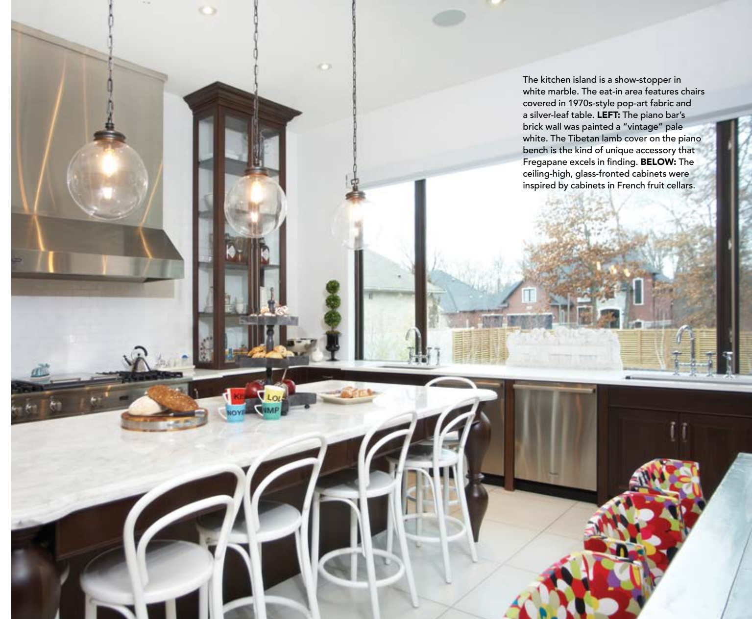
The kitchen island is a show-stopper in white marble. The eat-in area features chairs covered in 1970s-style pop-art fabric and a silver-leaf table. LEFT: The piano bar's brick wall was painted a "vintage" pale white. The Tibetan lamb cover on the piano bench is the kind of unique accessory that Fregapane excels in finding. BELOW: The ceiling-high, glass-fronted cabinets were inspired by cabinets in French fruit cellars.

The sightline from the foyer celebrates the home's hipster vibe. It is like looking into a New York stand-up piano bar. The photograph ( Tony Koukos World Travel Photography ) above the bar was one of the main sources of inspiration for the house, according to Doris. "It is like graffiti art," she says. More than one guest to the home has commented on how much the photograph resembles Doris herself.