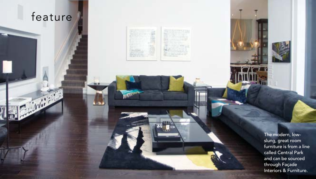
The modern, low-slung, great room furniture is from a line called Central Park and can be sourced through Façade Interiors & Furniture.