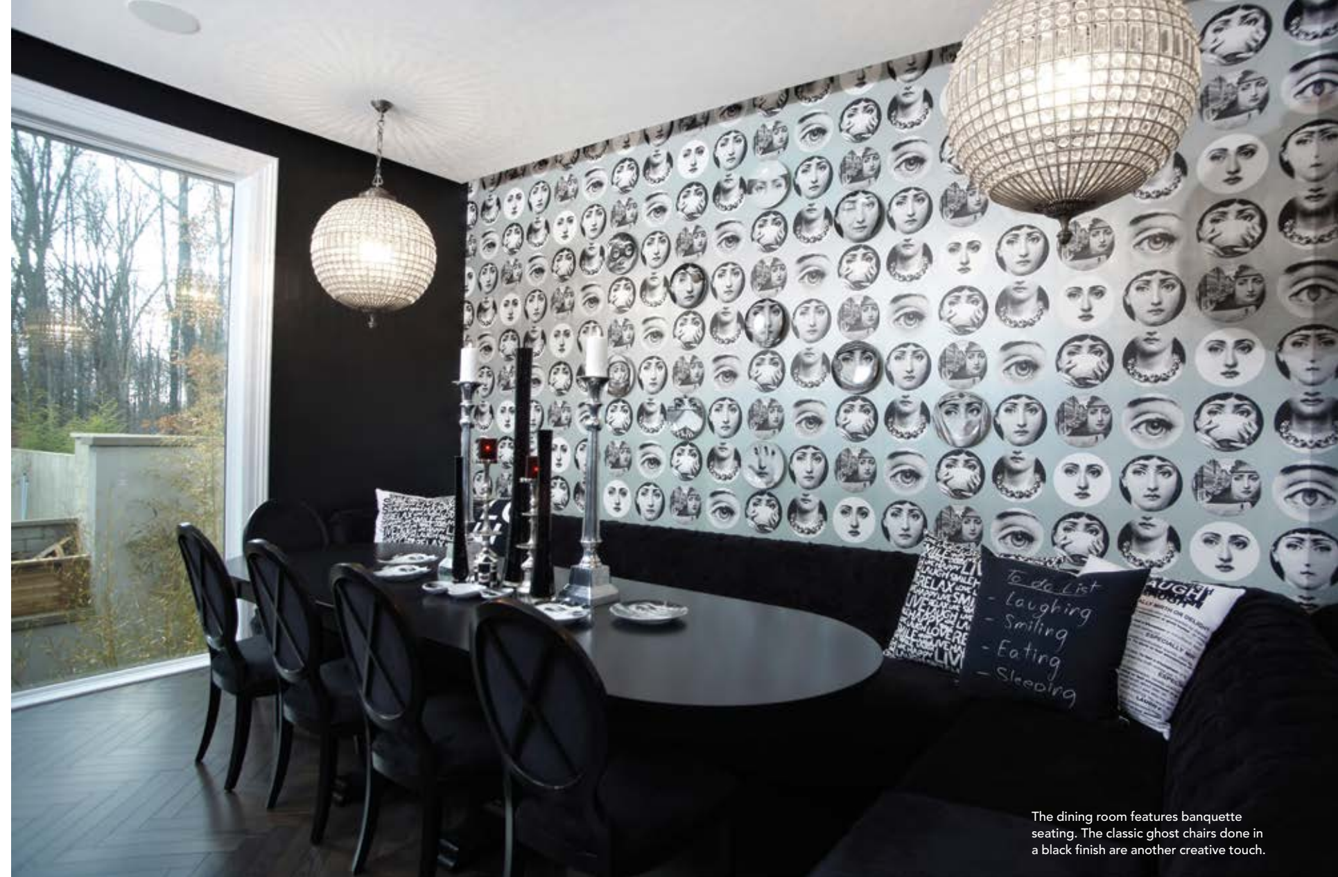
The dining room features banquette seating. The classic ghost chairs done in a black finish are another creative touch.

R ock n' Roll meets too-cool-for-school meets boutique hotel. Although Doris and Anthony Lapico's new home defies easy classification, one thing is abundantly clear, it is full-on spectacular.