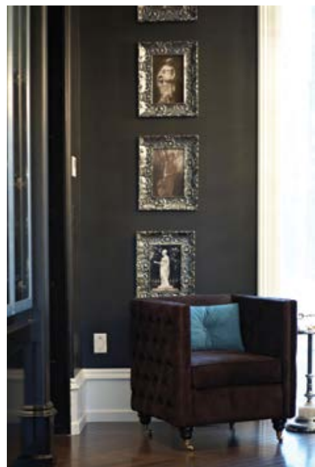
LEFT: A corner of the dining room. The silver framed art gives the room a touch of old-world luxury. BELOW: The home's dramatic entryway shows the exceptional millwork. The custom rug features a scroll design inspired by one that Doris saw in a NYC boutique hotel. RIGHT: The Lapico's go-to designer, Francesca Fregapane of Façade Interiors & Furniture. FAR RIGHT: The lounge area outside the main-floor powder room features a classic army green Jonathan Adler sofa, a two-tiered, vintage-inspired end table and dial phone.

To the immediate right of the foyer is a music room with an entire wall of floor-to-ceiling shelving ( Pinpoint Cabinetry ) that was custom built to house the couple's extensive collection of vinyl records. The room