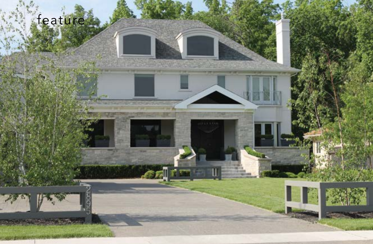
LEFT: The home's classic box-style is perfectly accented by the refined landscape design created by Lakeshore Landscaping. The grand front porch provides additional seating. Stucco work is by Abrik Professional Stucco Systems. BELOW LEFT: The outdoor kitchen features a wood-burning fireplace. It overlooks a stunning backyard pool that was designed and installed by The Great Outdoors. BELOW RIGHT: Classic grey wicker furnishings with pops of turquoise make the back porch a welcoming retreat.

designed like a bistro restroom, complete with a "lounge-style waiting room." The wallpaper for this area was designed by an English artist and is hand-embroidered with text from Shakespeare's A Midsummer Night's Dream . The outdoor living space is spectacular. There is a stone, wood-burning fireplace that is perfect three seasons of the year. French